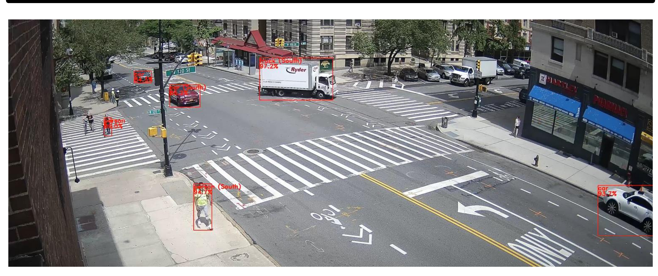
Fig. 3: Output Drawn by Implemented System